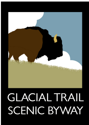
Proposed logo - yet to be finalized.

"I really enjoyed the peaceful scenery, the wildlife I spied, relaxing... and just doing "nothing!"